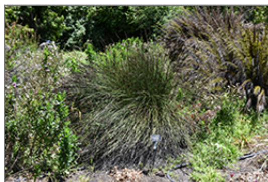
Small Cape Rush