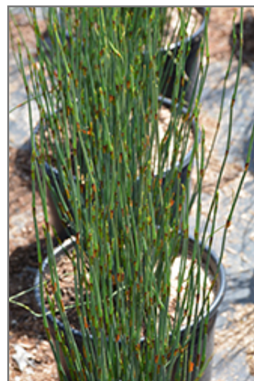
Small Cape Rush foliage