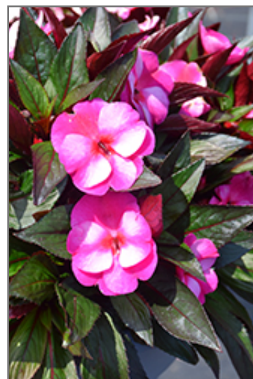
Petticoat Purple Star New Guinea Impatiens flowers

Petticoat Purple Star New Guinea Impatiens is recommended for the following landscape applications;