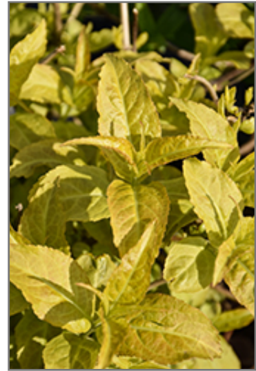
Firefly Diervilla foliage

This plant is not reliably hardy in our region, and certain restrictions may apply; contact the store for more information.