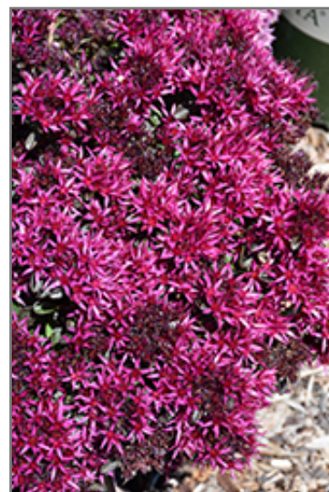
Spot On Deep Rose Stonecrop flowers

Spot On Deep Rose Stonecrop is recommended for the following landscape applications;