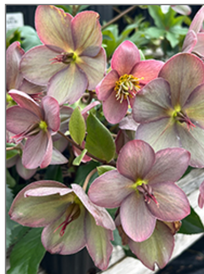
HGC Ice N' Roses Rose Hellebore flowers

HGC Ice N' Roses Rose Hellebore is recommended for the following landscape applications;