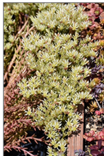
Red Wiggle Stonecrop flowers

Red Wiggle Stonecrop is recommended for the following landscape applications;