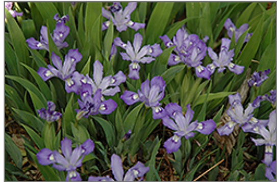
Dwarf Crested Iris flowers