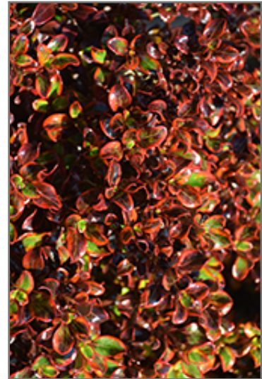
Scarlett O'Hara Mirror Bush foliage