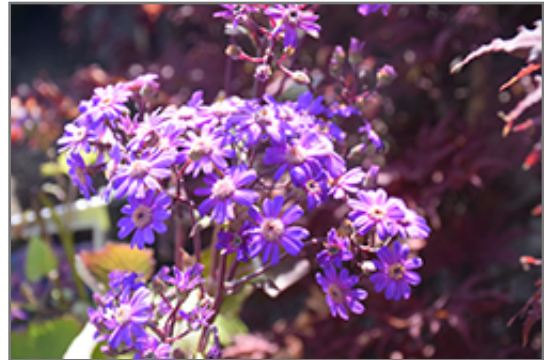
Giovanna's Select Senecio flowers