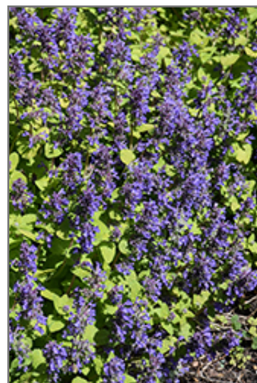
Chartreuse On The Loose Catmint flowers