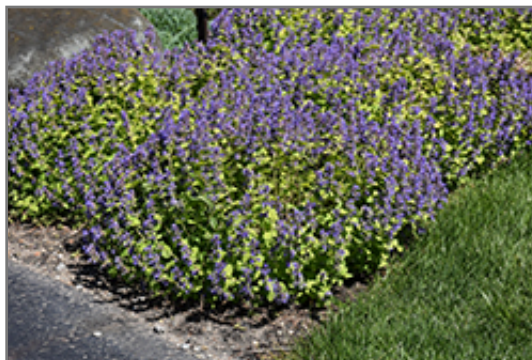
Chartreuse On The Loose Catmint in bloom

Chartreuse On The Loose Catmint is recommended for the following landscape applications;