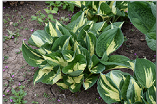
Pathfinder Hosta

Pathfinder Hosta is recommended for the following landscape applications;