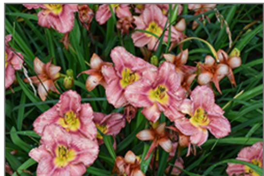
Happy Ever Appster Rosy Returns Daylily flowers