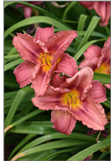
Happy Ever Appster Rosy Returns Daylily flowers

Happy Ever Appster Rosy Returns Daylily is recommended for the following landscape applications;