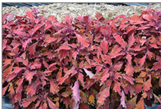
FlameThrower Habanero Coleus