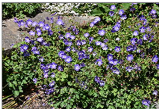
Brookside Cranesbill in bloom