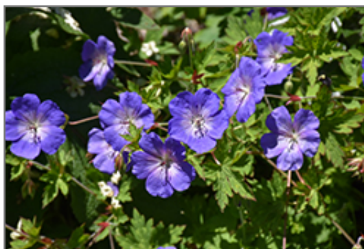
Brookside Cranesbill flowers

Brookside Cranesbill is recommended for the following landscape applications;