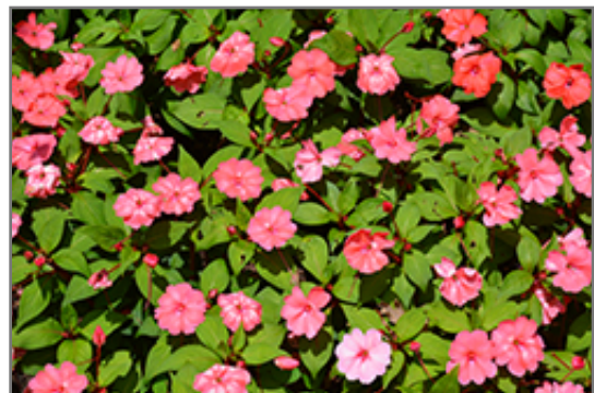
Solarscape XL Salmon Glow Impatiens flowers