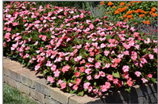
Solarscape XL Salmon Glow Impatiens in bloom

Solarscape XL Salmon Glow Impatiens is recommended for the following landscape applications;