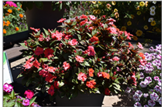
Solarscape Orange Burst Impatiens in bloom

Solarscape Orange Burst Impatiens will grow to be about 9 inches tall at maturity, with a spread of 20 inches. When grown in masses or used as a bedding plant, individual plants should be spaced approximately 14 inches apart. Its foliage tends to remain low and dense right to the ground. This fast-growing annual will normally live for one full growing season, needing replacement the following year.