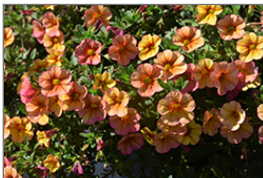
MiniFamous Uno Orange + Red Vein Calibrachoa flowers

MiniFamous Uno Orange + Red Vein Calibrachoa is recommended for the following landscape applications;