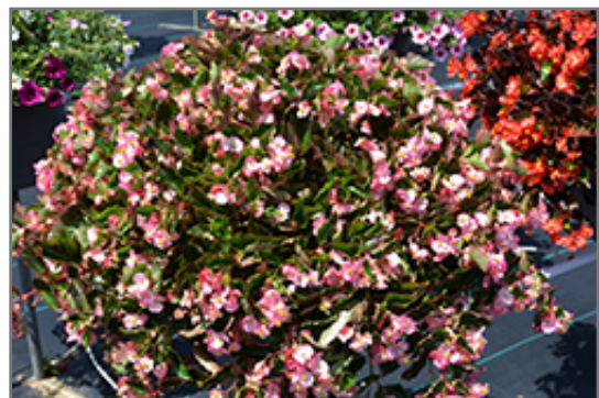
Hula Pink Begonia in bloom