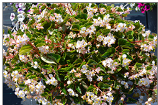
Hula Blush Begonia in bloom