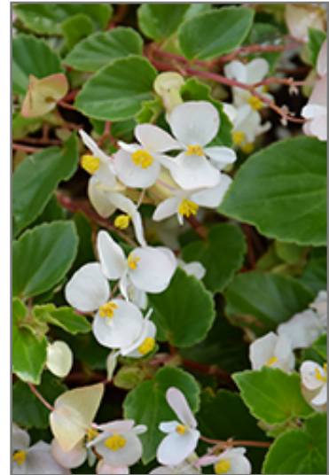
Hula Blush Begonia flowers

Hula Blush Begonia is an herbaceous annual with a ground-hugging habit of growth. Its medium texture blends into the garden, but can always be balanced by a couple of finer or coarser plants for an effective composition.