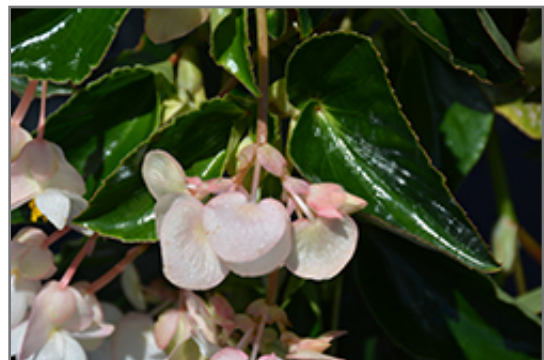
Dragon Wing White Begonia flowers