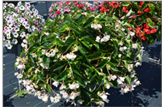
Dragon Wing White Begonia in bloom