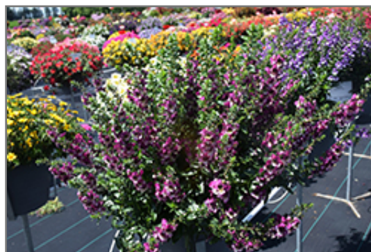
AngelDance Fuchsia Bicolor Angelonia in bloom