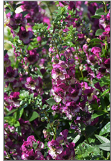
AngelDance Fuchsia Bicolor Angelonia flowers

AngelDance Fuchsia Bicolor Angelonia will grow to be about 14 inches tall at maturity, with a spread of 12 inches. When grown in masses or used as a bedding plant, individual plants should be spaced approximately 10 inches apart. Although it's not a true annual, this fast-growing plant can be expected to behave as an annual in our climate if left outdoors over the winter, usually needing replacement the following year. As such, gardeners should take into consideration that it will perform differently than it would in its native habitat.