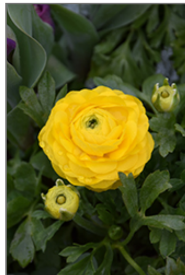
Double Meadow Buttercup flowers