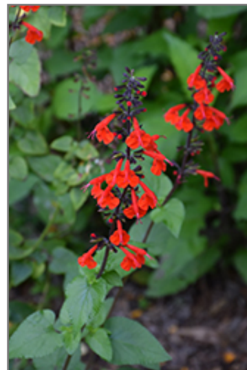
Scarlet Sage flowers

Scarlet Sage is recommended for the following landscape applications;