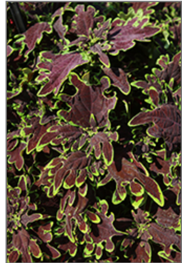
Limewire Coleus foliage