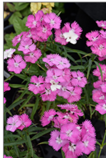
First Love Pinks flowers

First Love Pinks is recommended for the following landscape applications;