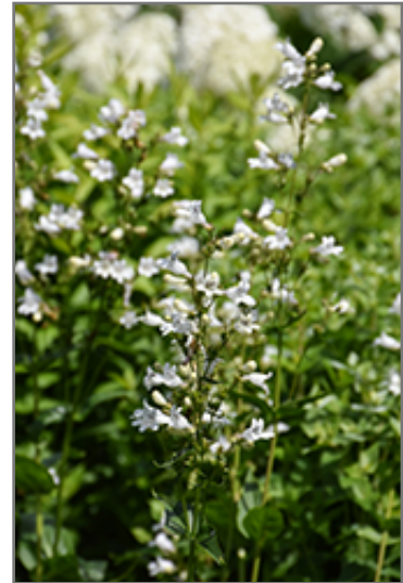
Foxglove Beardtongue flowers