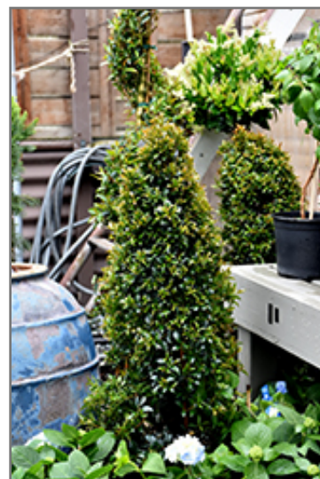
Dwarf Brush Cherry