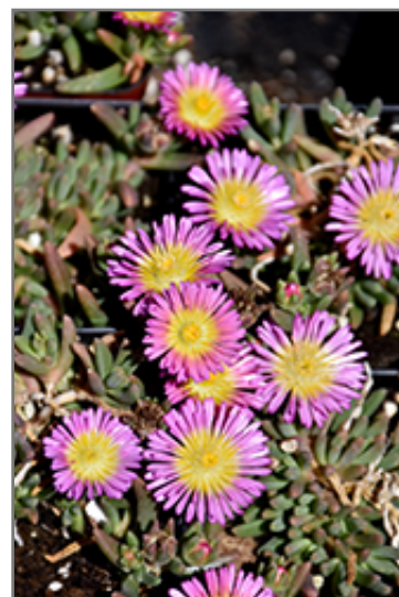
Delmara Pink Halo Ice Plant flowers

Delmara Pink Halo Ice Plant is recommended for the following landscape applications;