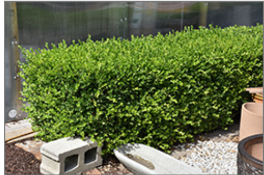
NewGen Independence Boxwood