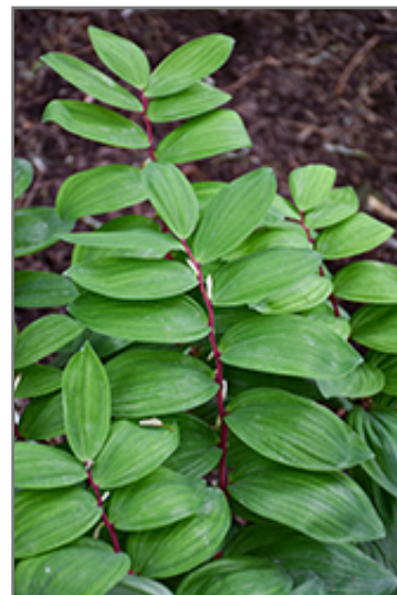
Ruby Slippers Solomon's Seal foliage

Ruby Slippers Solomon's Seal is recommended for the following landscape applications;