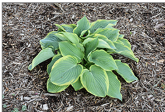
Gigantosaurus Hosta

Gigantosaurus Hosta is recommended for the following landscape applications;