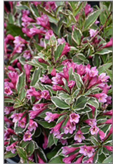
My Monet Purple Effect Weigela flowers

This plant is not reliably hardy in our region, and certain restrictions may apply; contact the store for more information.