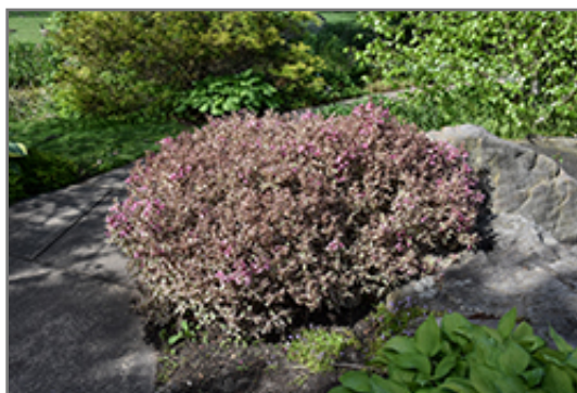
My Monet Purple Effect Weigela in bloom