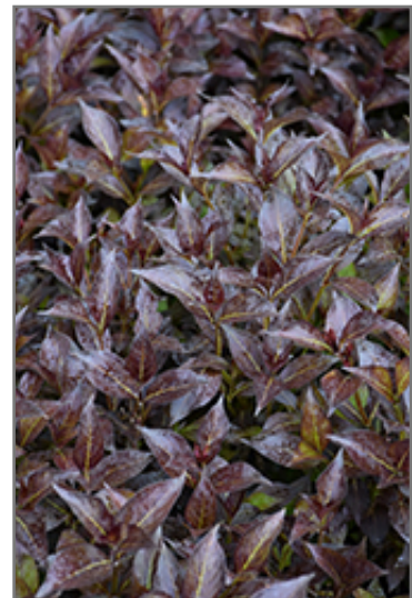
Midnight Wine Shine Weigela foliage