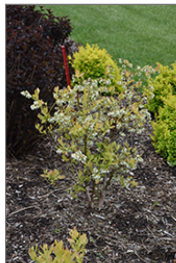
Sky Dew Gold Ornamental Blueberry in bloom

This plant is not reliably hardy in our region, and certain restrictions may apply; contact the store for more information.