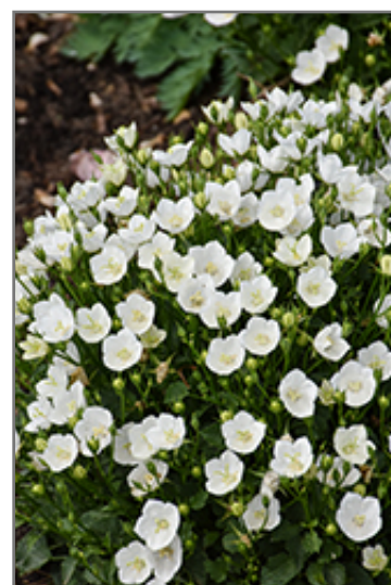
Mini Marvels Starbright Bellflower flowers