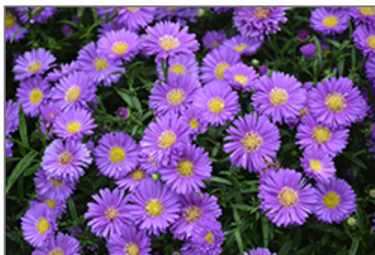
Magic Purple Aster flowers

Magic Purple Aster is recommended for the following landscape applications;