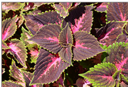
Main Street Michigan Avenue Coleus foliage