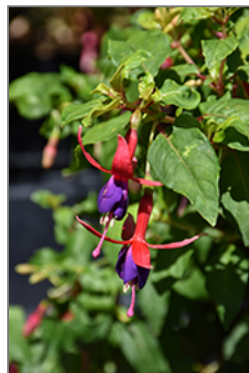
Golden Gate Hardy Fuchsia flowers