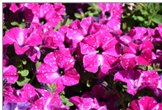
Headliner Enchanted Sky Petunia flowers