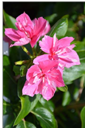
Soiree Double Pink Vinca flowers

Soiree Double Pink Vinca is recommended for the following landscape applications;