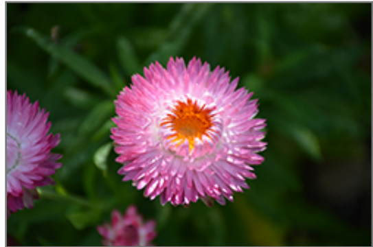
Granvia Pink Strawflower flowers