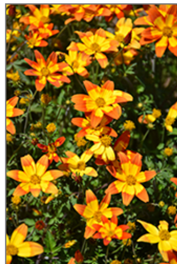
Beezar Funny Honey Bidens flowers