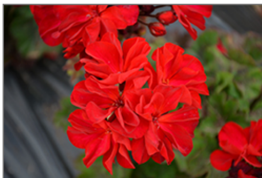
Super Moon Red Geranium flowers

Super Moon Red Geranium is recommended for the following landscape applications;