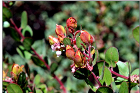
Canyon Blush Manzanita flowers

Canyon Blush Manzanita will grow to be about 4 feet tall at maturity, with a spread of 20 feet. It tends to fill out right to the ground and therefore doesn't necessarily require facer plants in front. It grows at a slow rate, and under ideal conditions can be expected to live for approximately 30 years.