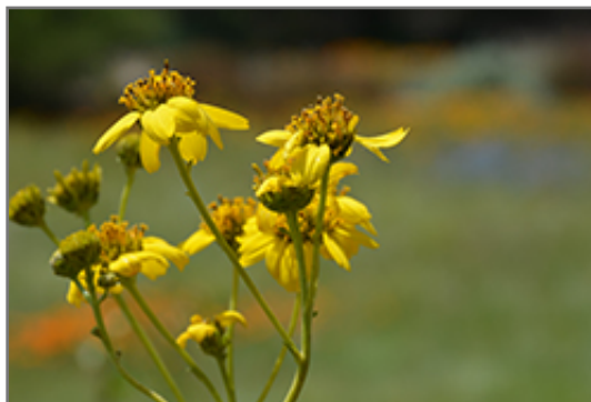
Cedros Island Crownbeard flowers

Cedros Island Crownbeard is recommended for the following landscape applications;