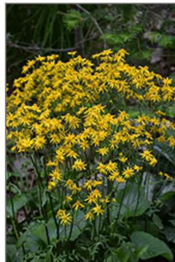
Golden Ragwort flowers

Golden Ragwort will grow to be about 12 inches tall at maturity extending to 24 inches tall with the flowers, with a spread of 12 inches. When grown in masses or used as a bedding plant, individual plants should be spaced approximately 10 inches apart. It grows at a medium rate, and under ideal conditions can be expected to live for approximately 10 years. As an herbaceous perennial, this plant will usually die back to the crown each winter, and will regrow from the base each spring. Be careful not to disturb the crown in late winter when it may not be readily seen!