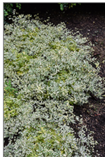
Golden Feathers Jacob's Ladder foliage