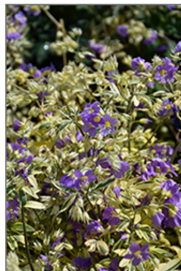
Golden Feathers Jacob's Ladder flowers

Golden Feathers Jacob's Ladder is recommended for the following landscape applications;