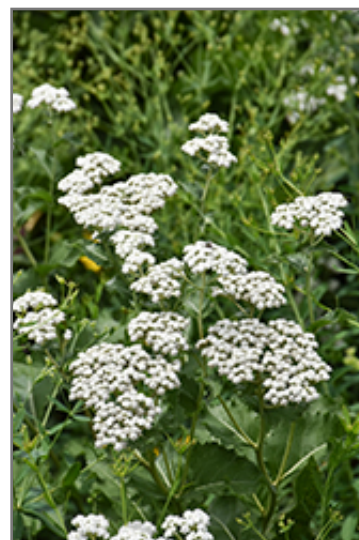
Wild Quinine flowers

Wild Quinine is recommended for the following landscape applications;