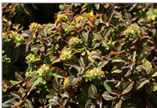
Night Light Moneywort foliage