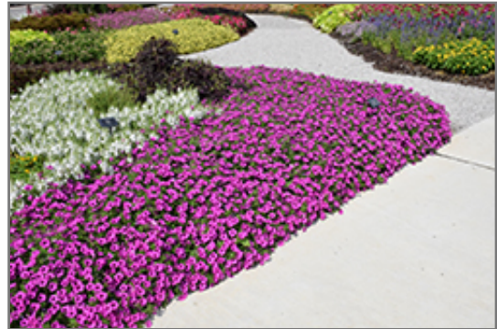
Supertunia Vista Jazzberry Petunia in bloom

Supertunia Vista Jazzberry Petunia will grow to be about 24 inches tall at maturity, with a spread of 3 feet. When grown in masses or used as a bedding plant, individual plants should be spaced approximately 20 inches apart. Its foliage tends to remain dense right to the ground, not requiring facer plants in front. This fast-growing annual will normally live for one full growing season, needing replacement the following year.