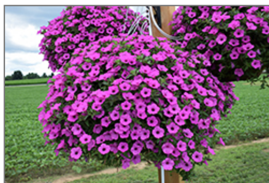
Supertunia Vista Jazzberry Petunia in bloom